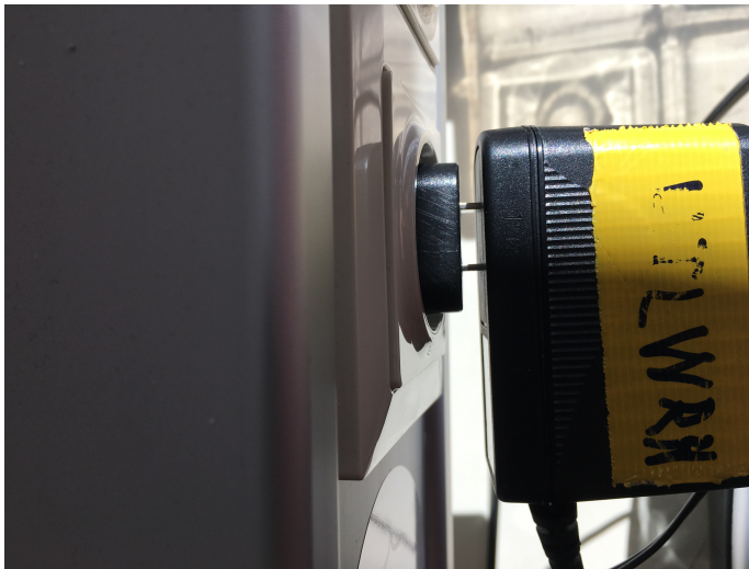
Fig. 2. Open contacts on charger

This could lead into the user dropping the charger, which could cause damage to both, the user and the charger.