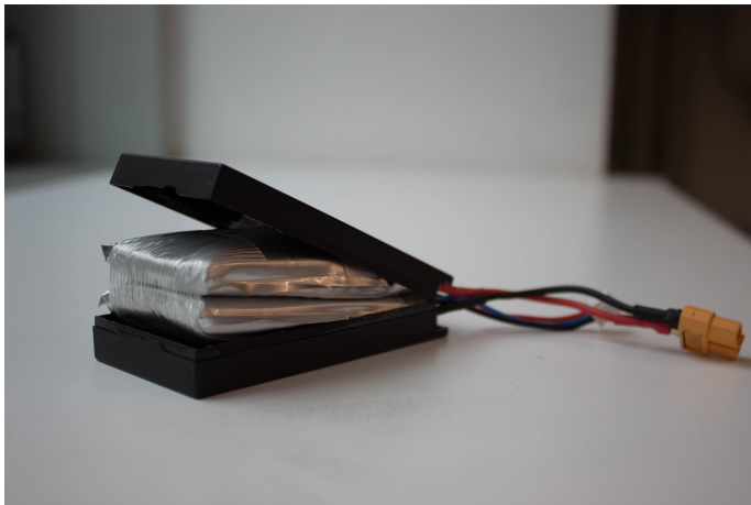
Fig. 3. Puffed battery

There are a lot of problems with batteries, which have been encountered during the last two seasons. Two batteries started burning/smoking (one with the cell balancer dongle and one without) and one person got hurt while quickly removing the burning battery from the robot to prevent damage to the Wallaby or the bot. One battery exploded 3 while charging over night, which could have easily caused a fire at school, because the batteries were not in a "LiPo-Guard" bag (these bags were not recommended by KIPR) while charging. Cause of this explosion was the unintentional use of the old charger that was provided with the first type of batteries, which has not got a cell balancer built in.